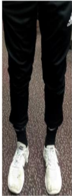
Socks tucked in trousers not allowed