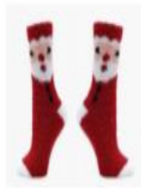
No fluffy socks!