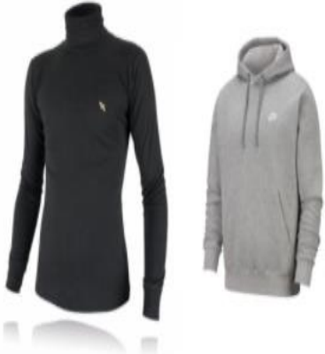
No other jacket, hoodie, half zip, sweatshirt etc. is permitted, either above or beneath the school jumper or school 1/2 zip.