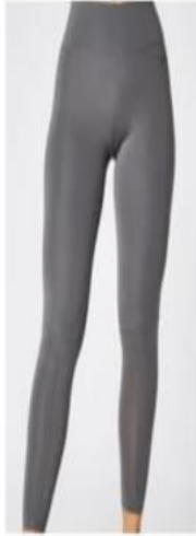
Leggings or jeggings not allowed